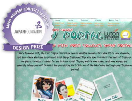
Luton Sixth Form College