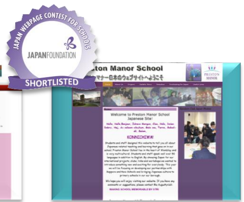
Preston Manor School