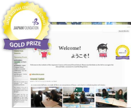
Newstead Wood School

We are delighted to announce the winners of the Japan Webpage Contest for Schools 2011-2012. We hope that these webpages can inspire you and give you ideas for your own Japan-related Websites.