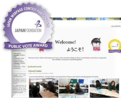
Newstead Wood School