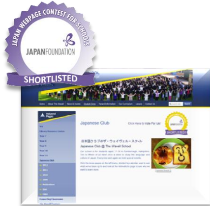
The Wavell School