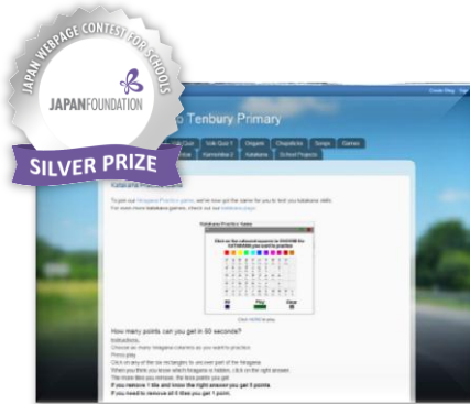
Tenbury CofE Primary School