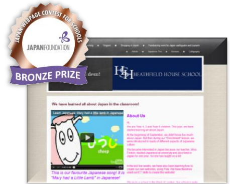
Heathfield House School