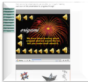
St Francis RC Primary School