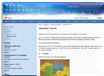
Ysgol Gyfun Gymunedol Penweddig