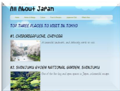
Prendergast Hillyfields College