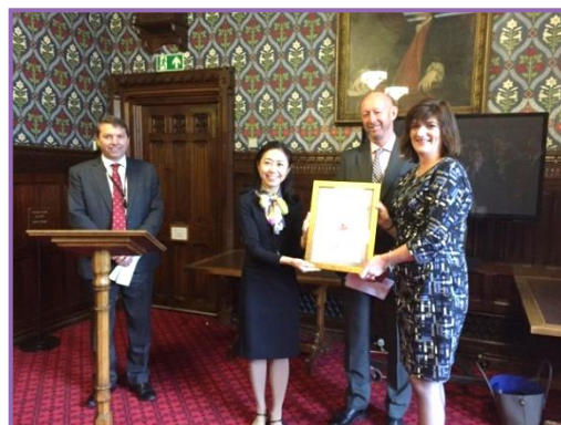
DGS was awarded Sakura Network membership in front of MP Gareth Johnson, a DGS alumni, and Nicky Morgan, the Secretary of State for Education